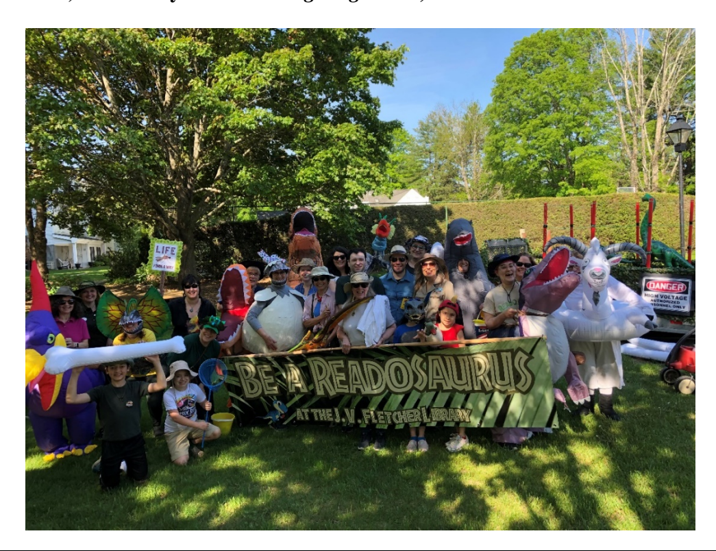
"We feel very fortunate to have a library like the Fletcher which provides so much enrichment and education to the community. Thank you so much!" Library Patron

Volunteers, In-Library and Friends giving over 3,900 hours