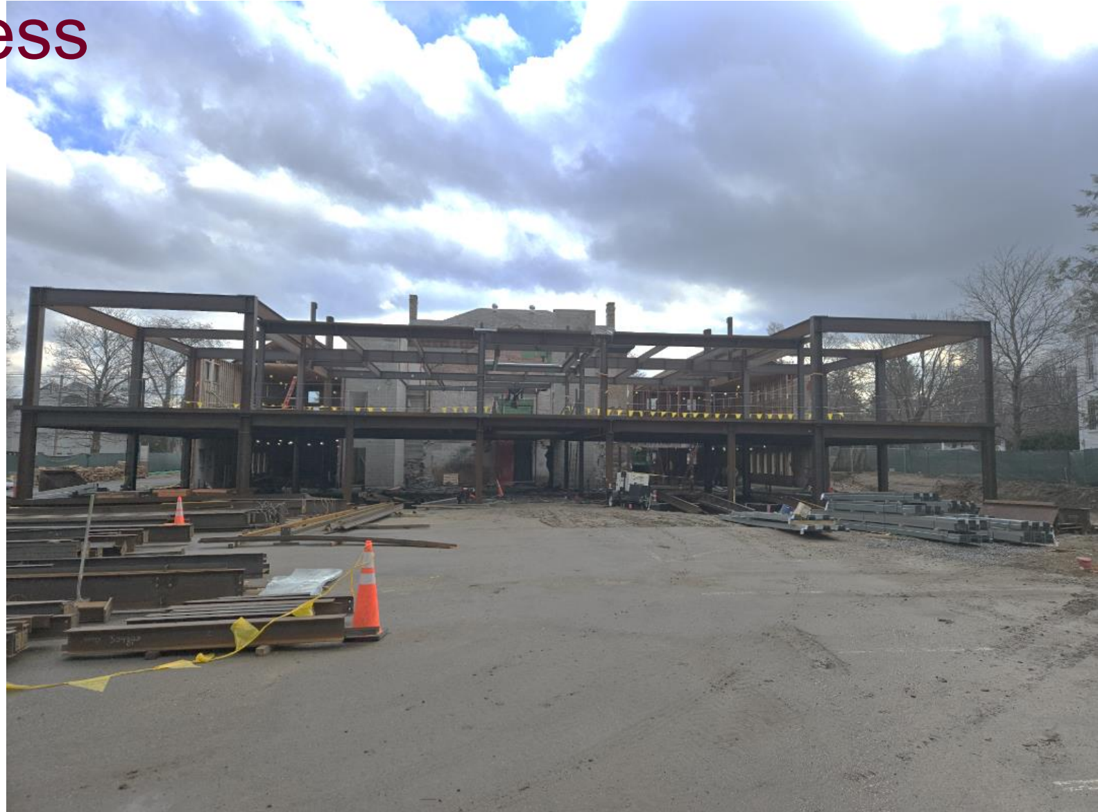
Construction Progress, Steel Erection, January 2026