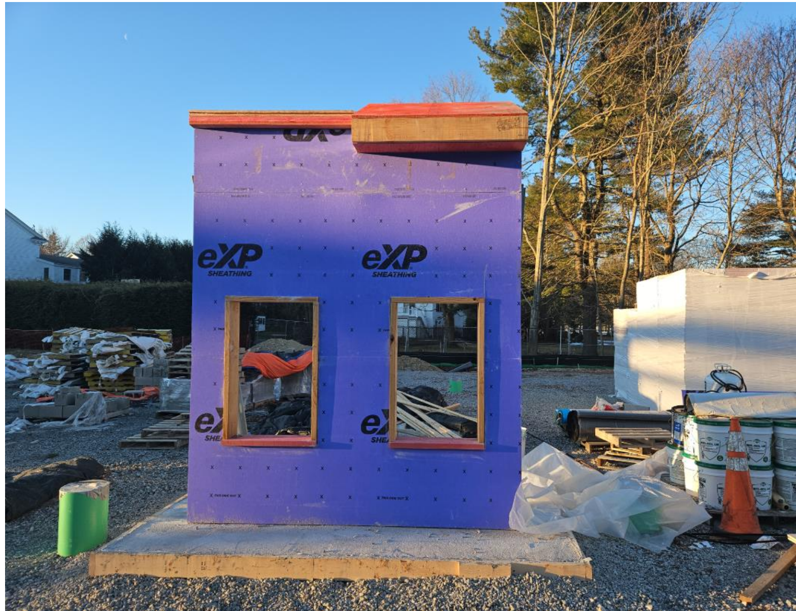
Construction Progress of Mockup, January 2025

Summary: The project remains on schedule and within budget. Work to enclose the new addition begins this month. No Select Board action is required currently.