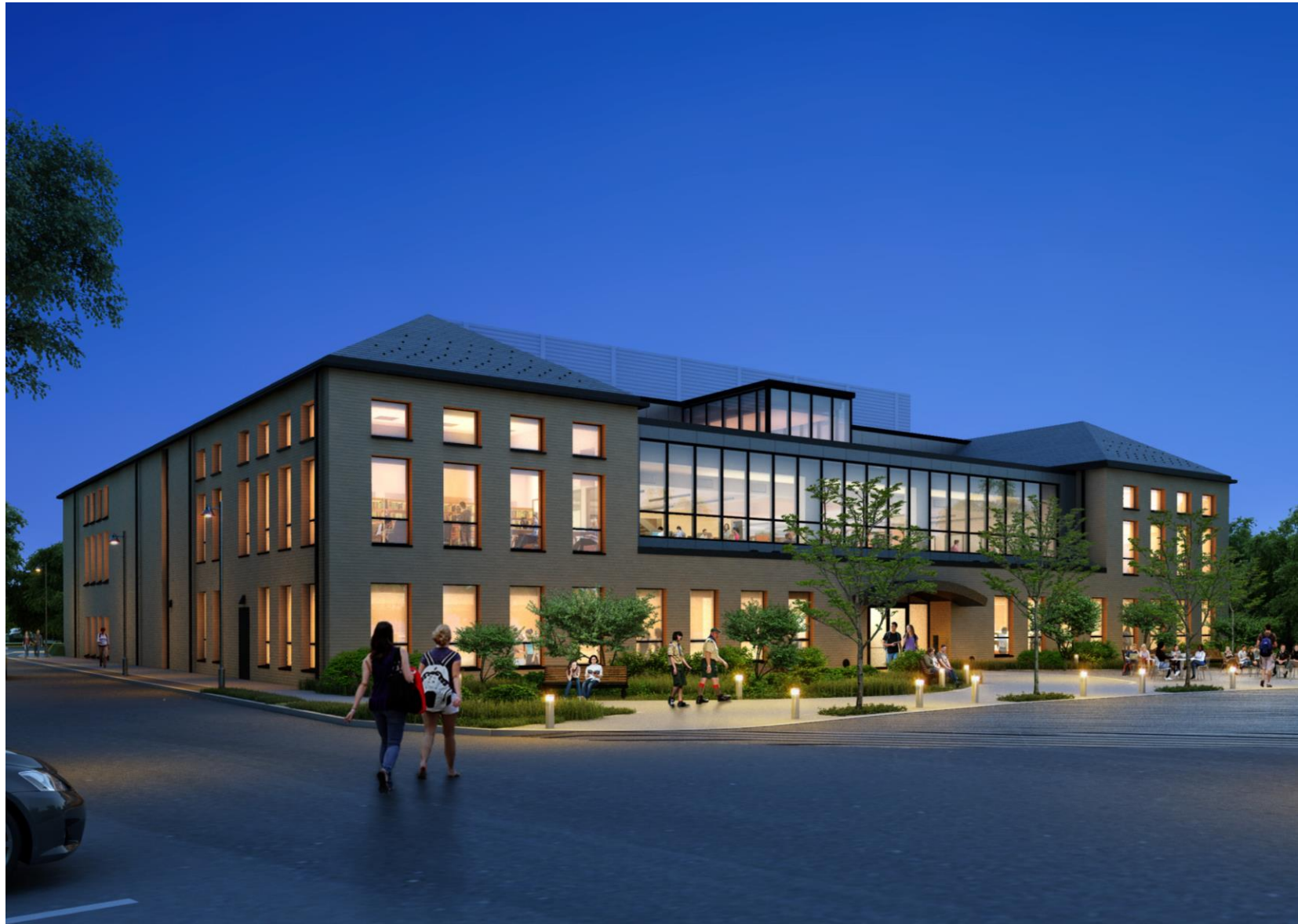
Rendering of New Rear Entry