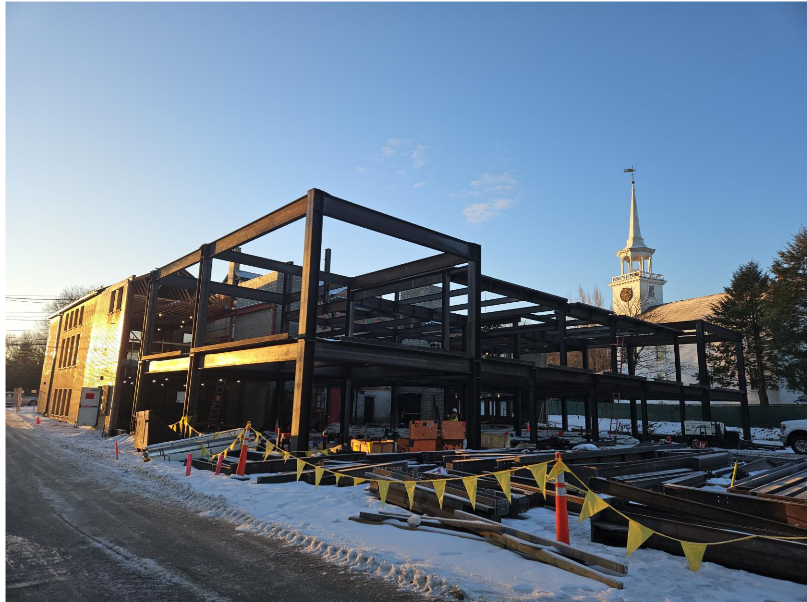
Construction Progress of Steel Erection, January 2026