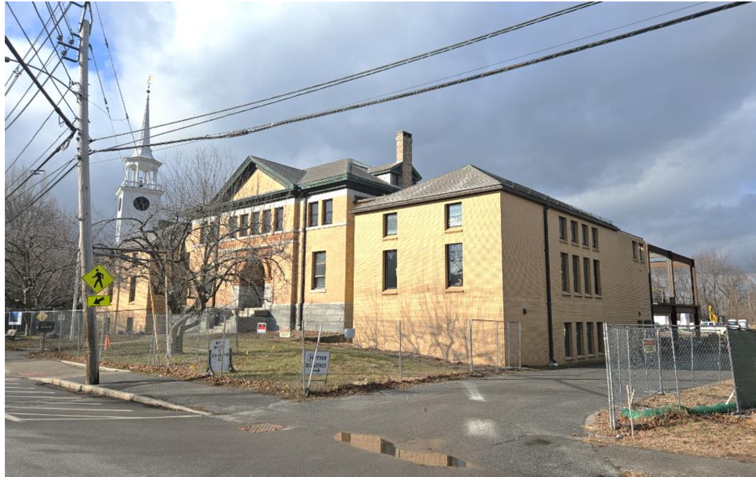
Construction Progress at Main Street Elevation, January 2026