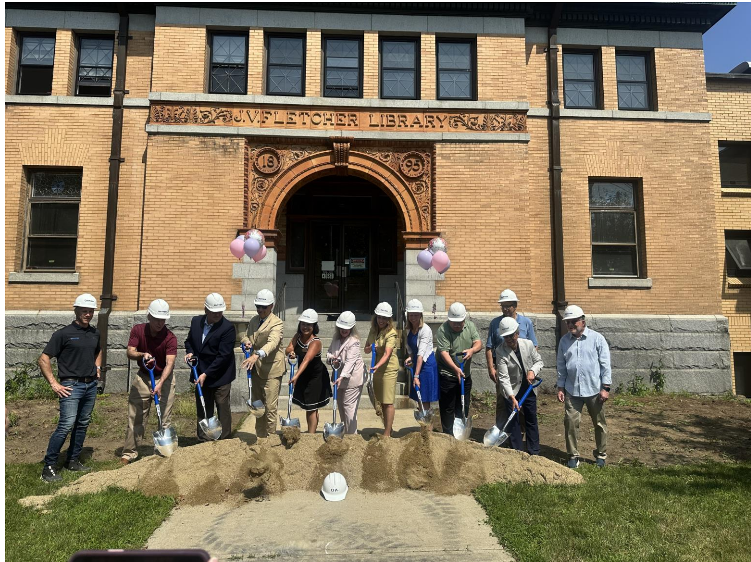
Project Groundbreaking, June 2025

Project information can be found at: Town and Library websites, Westford CAT Recordings and Monthly Building Committee Meetings & Minutes.