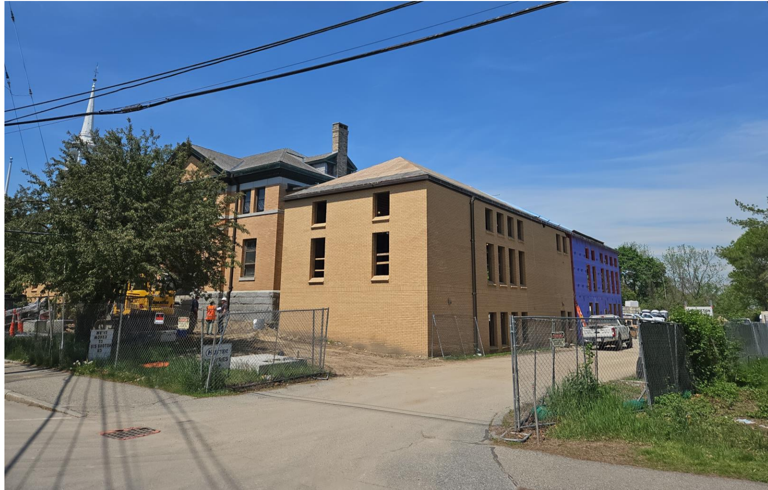
Construction Progress at Main Street Elevation, May 2026