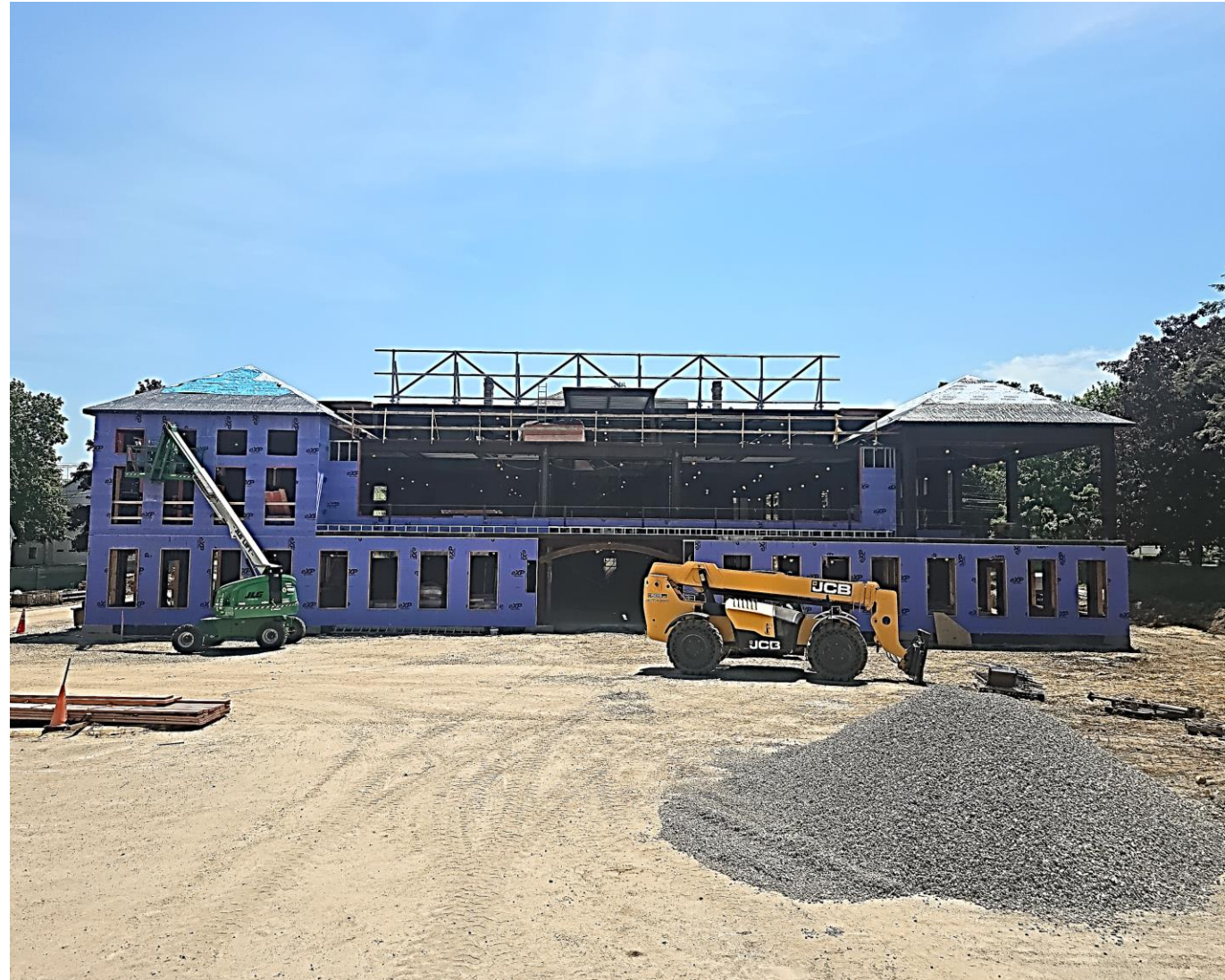
Construction Progress, Exterior Envelope, May 2026