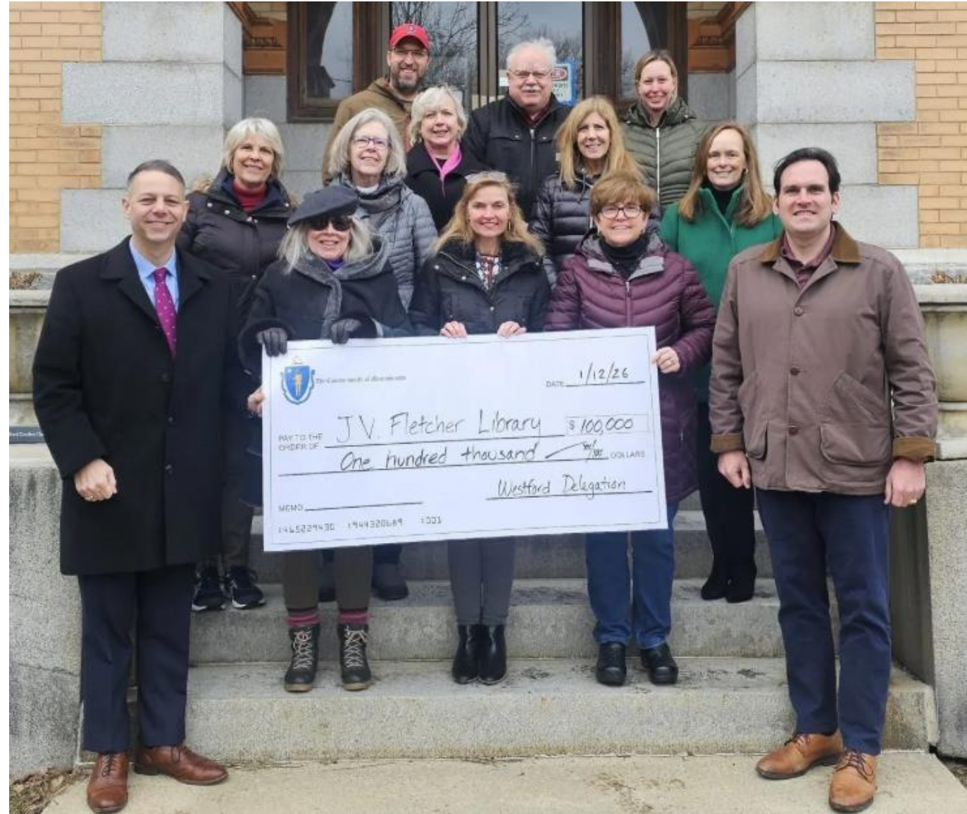
Audio Visual Equipment Funding from Westford Delegation, January 2026

Project information can be found at: Town and Library websites, Westford CAT Recordings and Monthly Building Committee Meetings & Minutes.