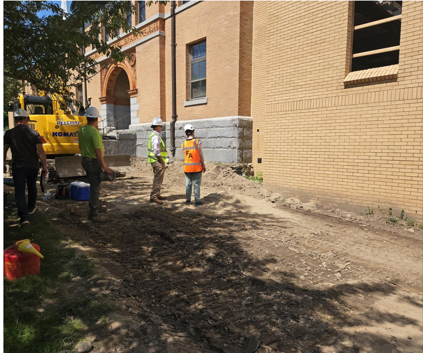
Construction Progress, On-site Walkthrough, May 2026

Summary: The project remains on budget, with a revised schedule. No design or program elements have been compromised. No Select Board action is required currently.