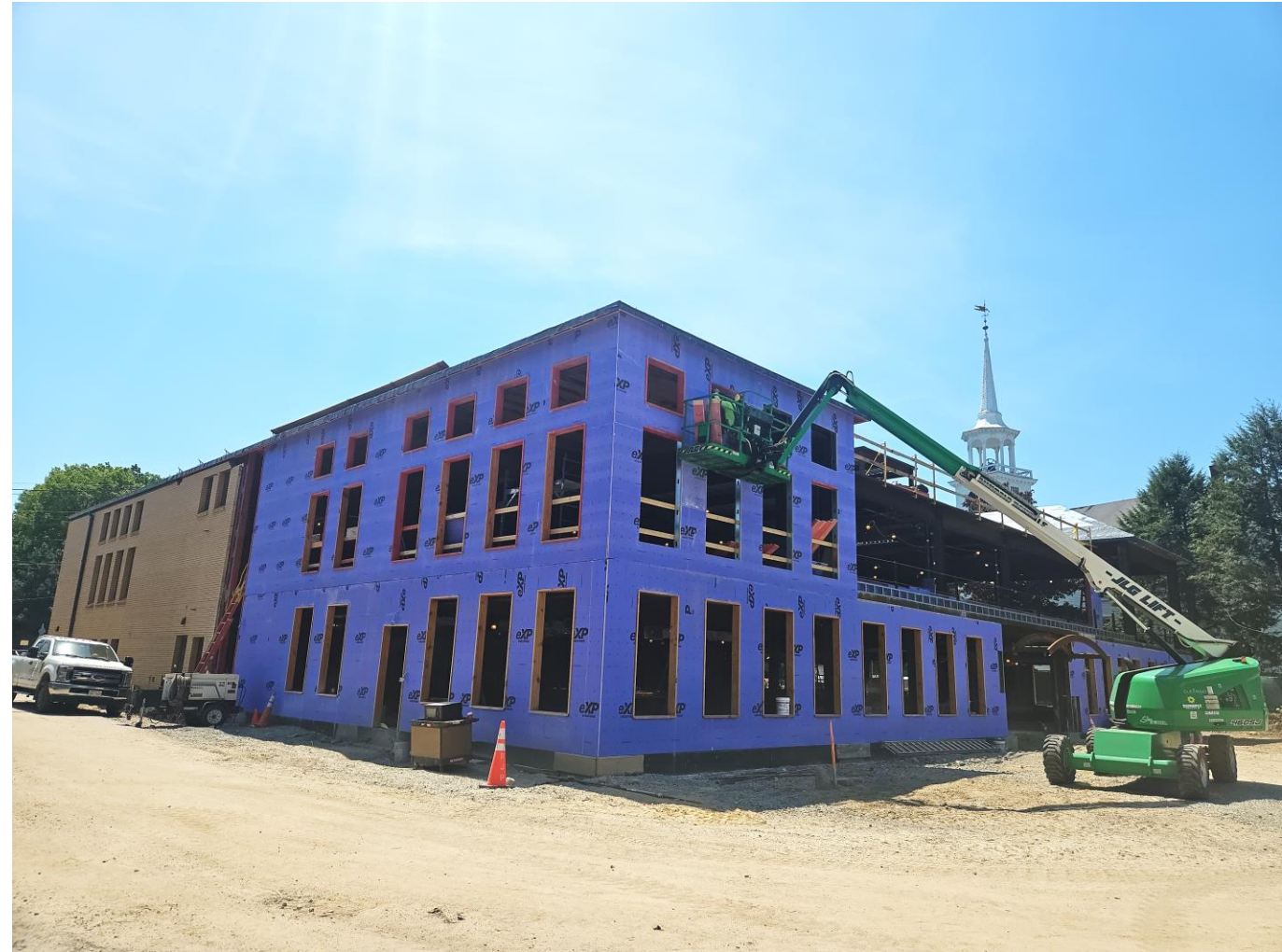
Construction Progress of New Facade, May 2026