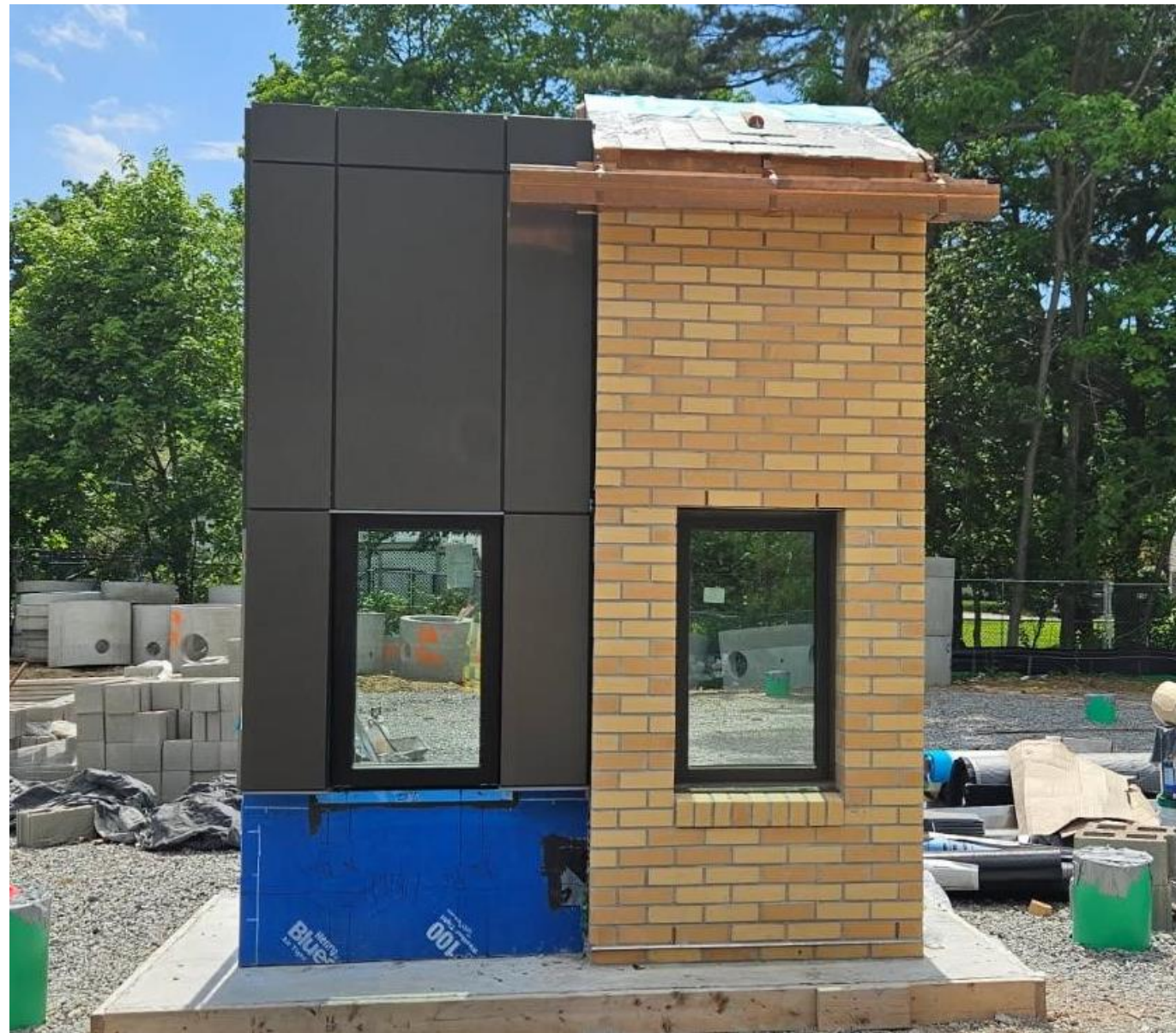
Construction Progress of Mockup, May 2025

All known risks are being managed. No Select Board action needed at this time.